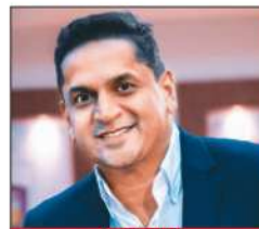
Firoz Thairimil Westford Education Group