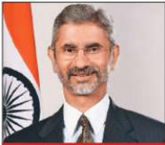
Dr. S. Jaishankar Indian Ministry of External Affairs