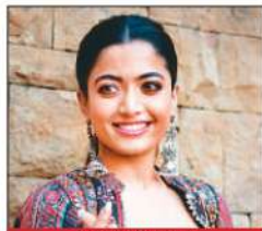
Rashmika Mandanna Indian Actress