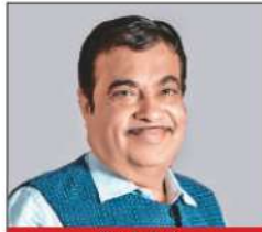
Nitin Gadkari Union Minister of Road Transport and Highways (MoRTH)