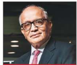
RC Bhargava Maruti Suzuki